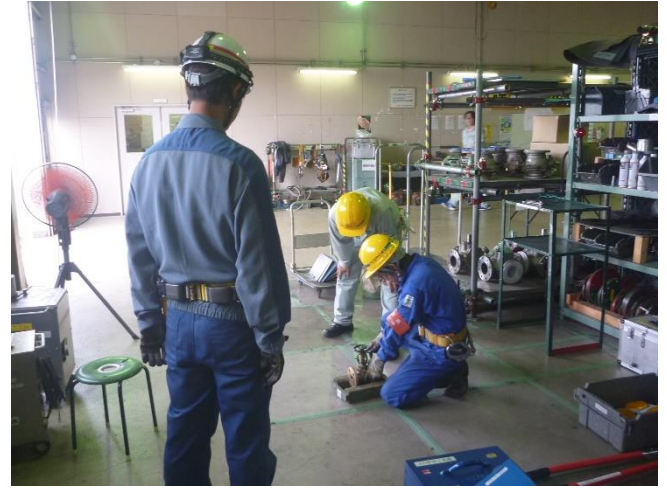
On-site behavioral observation

Cases gathered by contractors: about 3,500 (at F1, April-July)