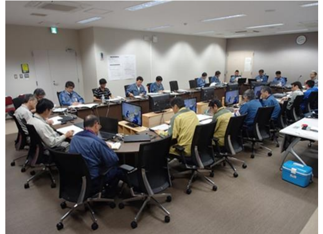
Information being shared with TEPCO's contractors (1F)

* "Standard observation perspective" means that outlined in the World Association of Nuclear Operators (WANO) Performance Objectives and Criteria (WANO PO&C).